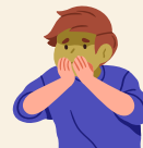
Throwing up or feeling sick to stomach