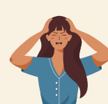
Increased agitation, restlessness or trouble sleeping

These should go away in 2 or 3 days. If they last longer than 3 days, there may be something else causing these problems.