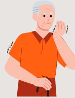
Tremors or involuntary movements