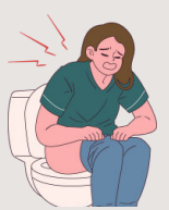
A hard time or not able to poop

These side effects should go away in 2 or 3 days. If they last longer than 3 days, call Hosparus Health.