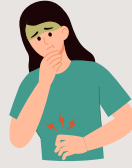
Nausea or vomiting