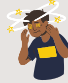
Seeing or hearing things that are not there